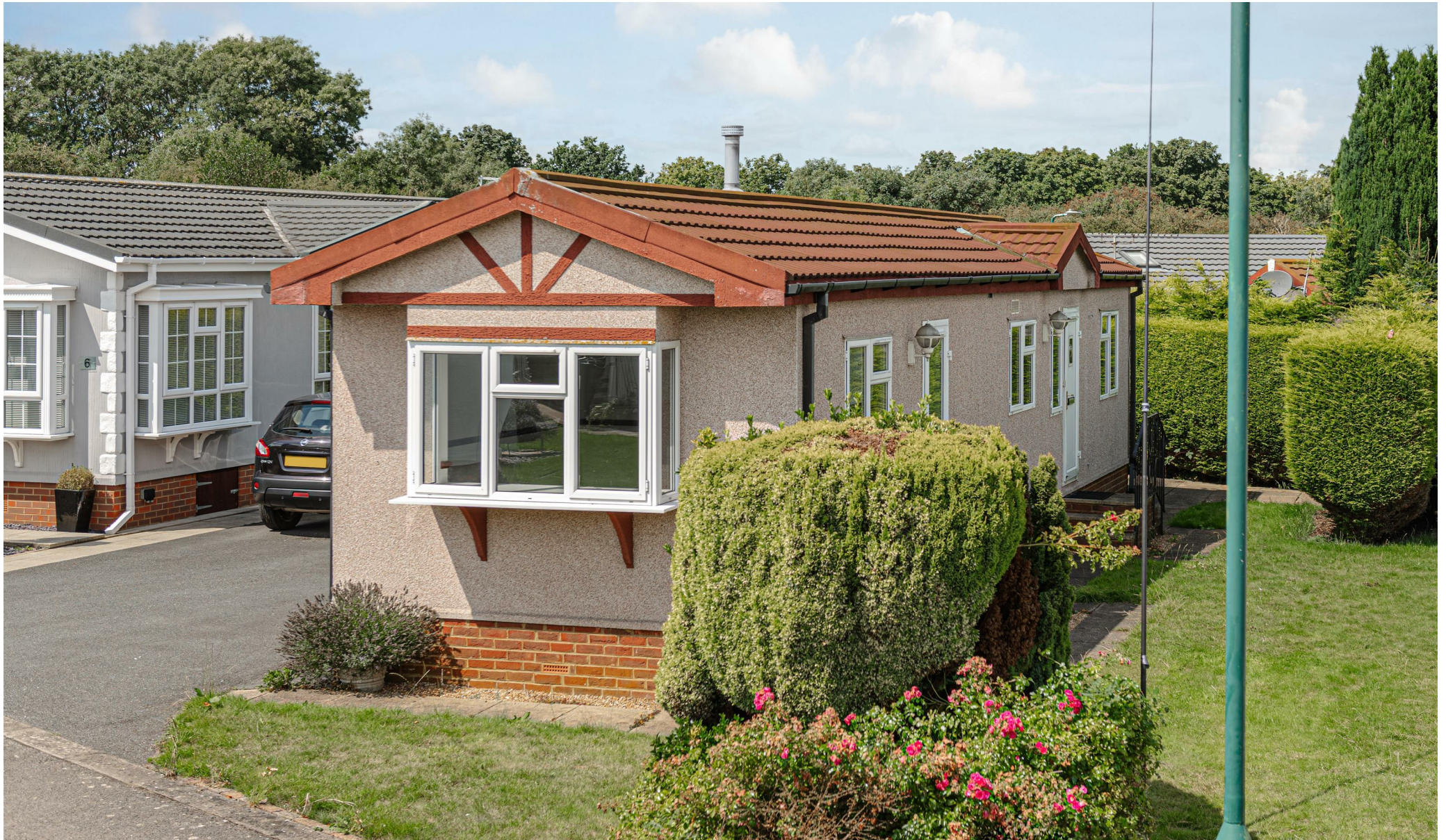
Holly Lodge, Tadworth £110,000